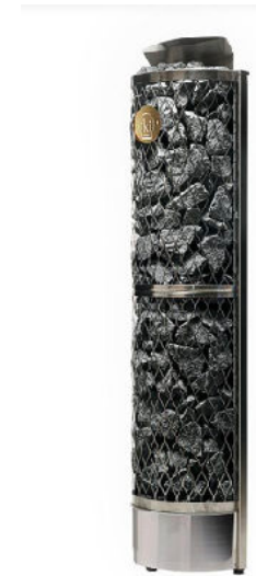
IKI WALL 6KW