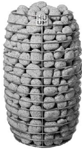
HUUM HIVE MINI