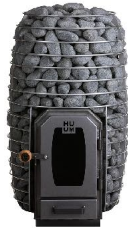
HUUM WOOD 13KW