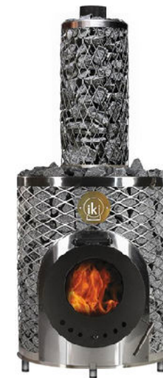
IKI MINI PLUS